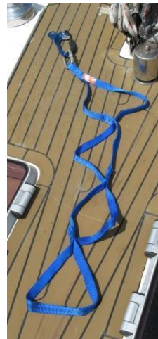
plus small pulley .

Descender (I use a Petzl GriGri as it is small, but there are better ones, see middle pic below).